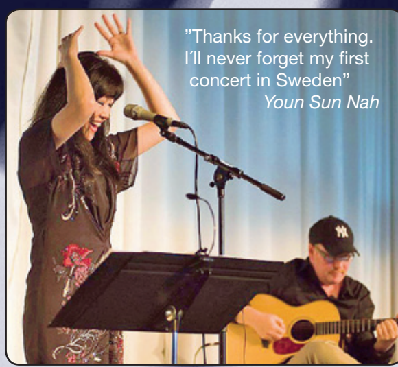
"Ystad Sweden Jazz Festival is a fantastic Jazz festival! It has put Sweden back on the map. Im proud and happy!" Ulf Wakenius